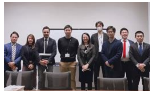
Second meeting in Japan