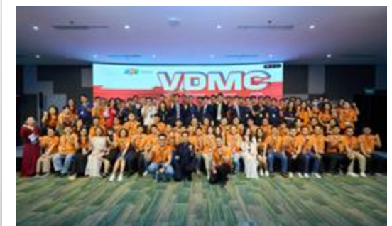
Offshore Development Center supporting client reached 400 IT professionals