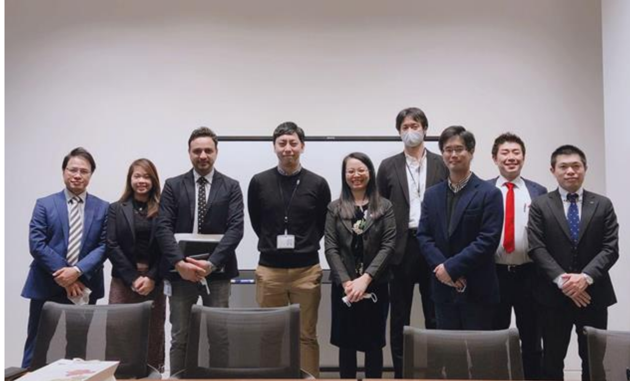
Second meeting in Japan - 8/12/2020