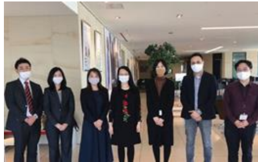
First meeting in Japan