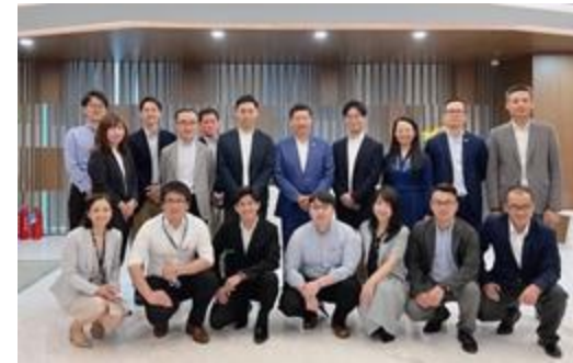
Client's first visit to Vietnam