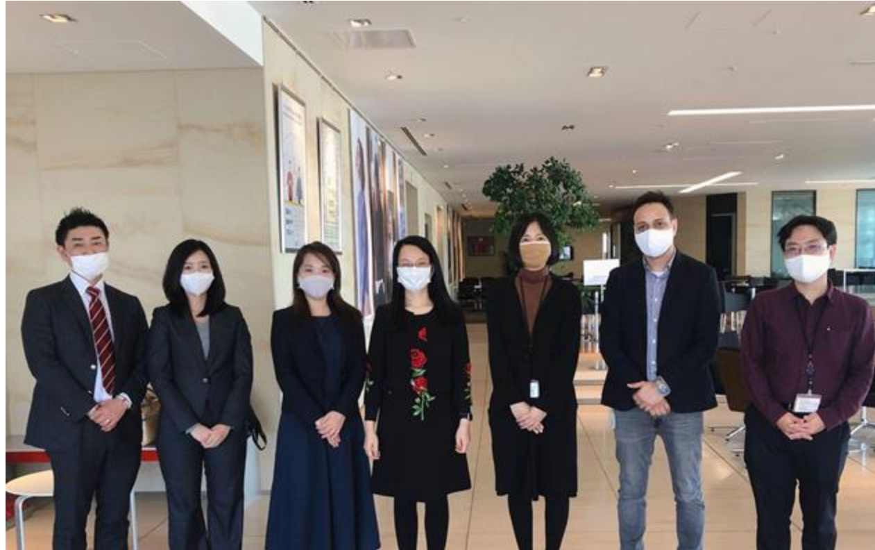
First meeting in Japan - 16/11/2020